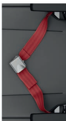
Seat Belt Colour