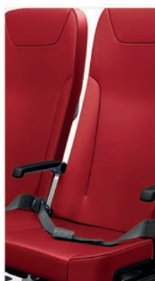
Dress Cover Colour