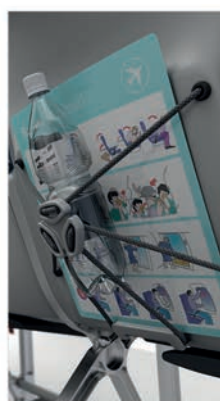
Bungee Cord Colour