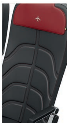
Bespoke Dress Cover Design